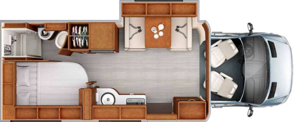
U24CB | Corner Bed (Shown with Standard Dinette)