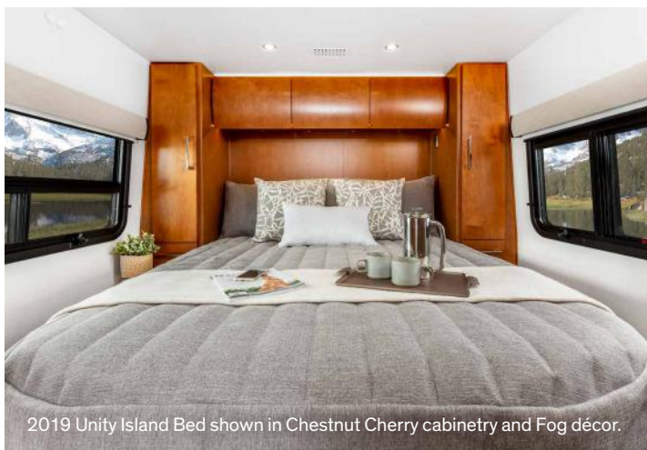
2019 Unity Island Bed shown in Chestnut Cherry cabinetry and Fog décor.