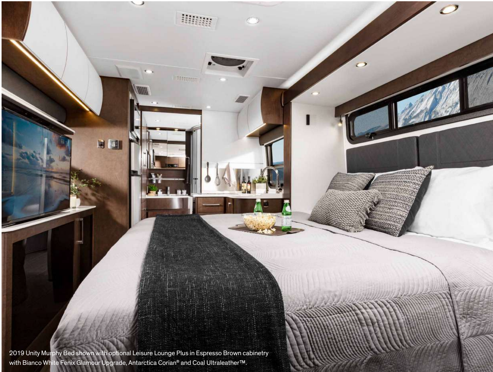
2019 Unity Murphy Bed shown with optional Leisure Lounge Plus in Espresso Brown cabinetry with Bianco White Fenix Glamour Upgrade, Antartica Corian® and Coal Ultraleather™.