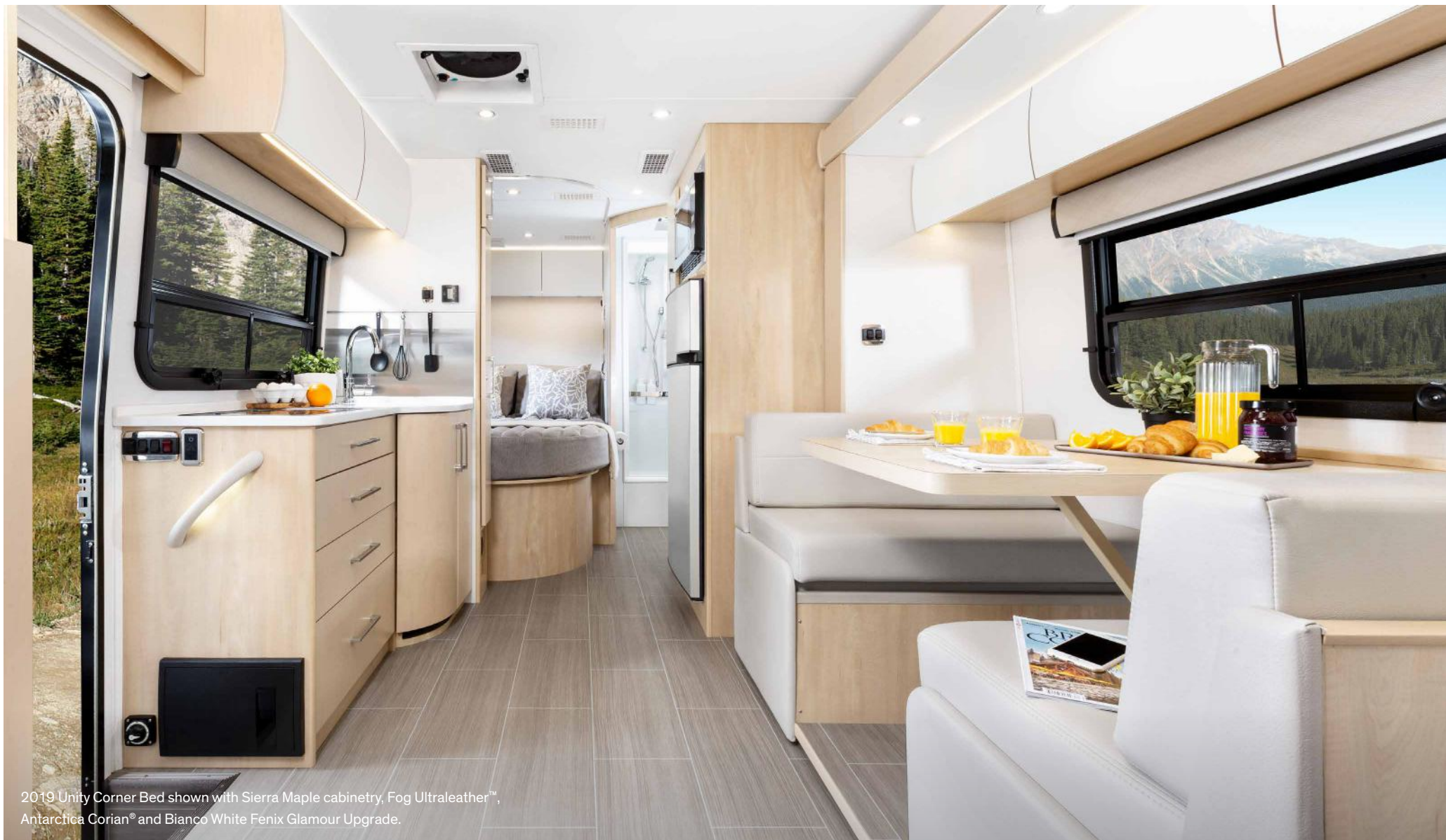
2019 Unity Corner Bed shown with Sierra Maple cabinetry, Fog Ultraleather™, Antarctica Corian® and Bianco White Fenix Glamour Upgrade.