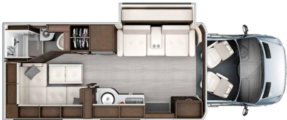
U24FX | Flex