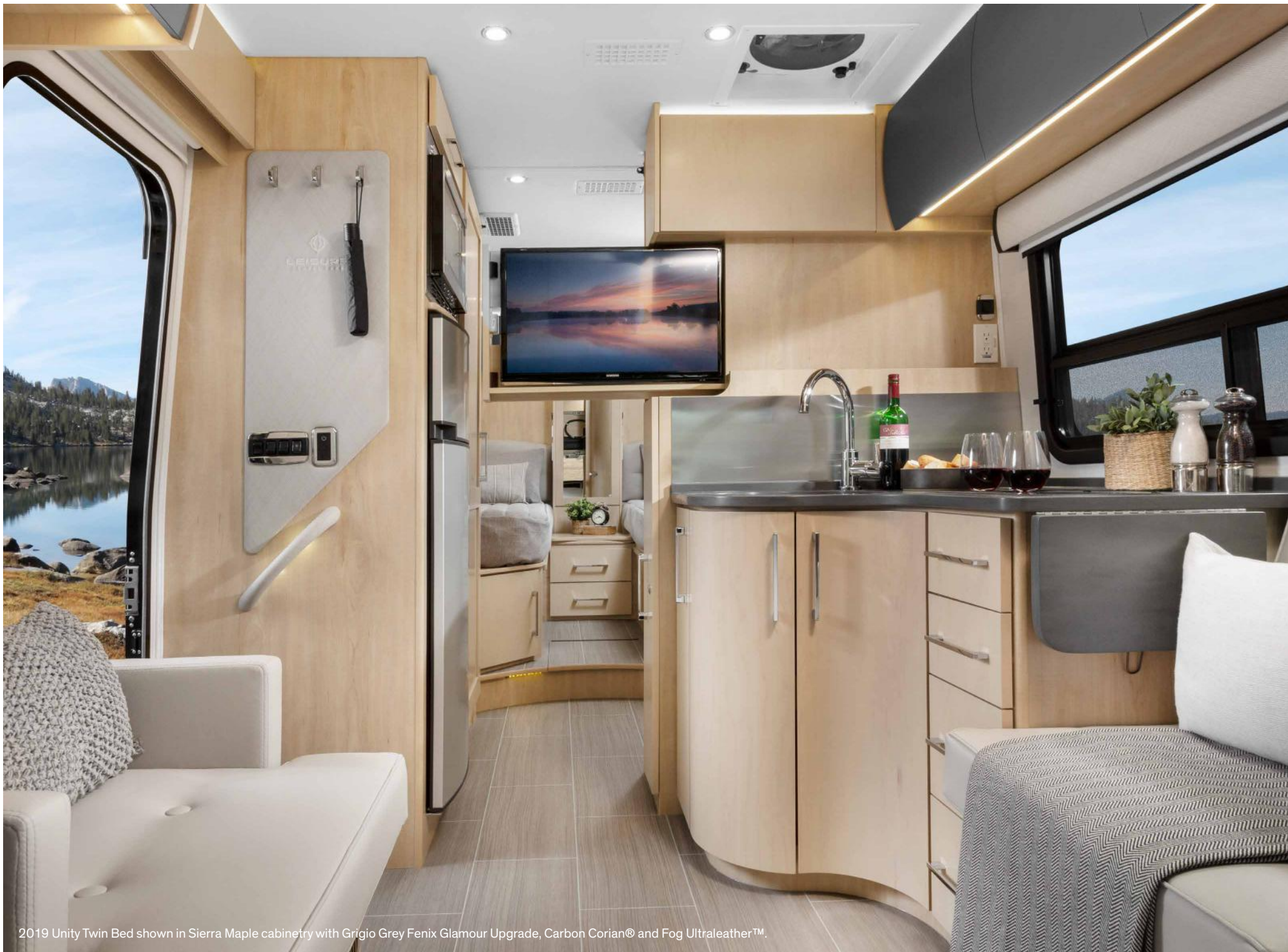
2019 Unity Twin Bed shown in Sierra Maple cabinetry with Grigio Grey Fenix Glamour Upgrade, Carbon Corian® and Fog Ultraleather™.