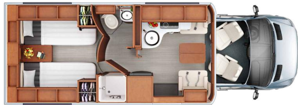
U24TB | Twin Bed