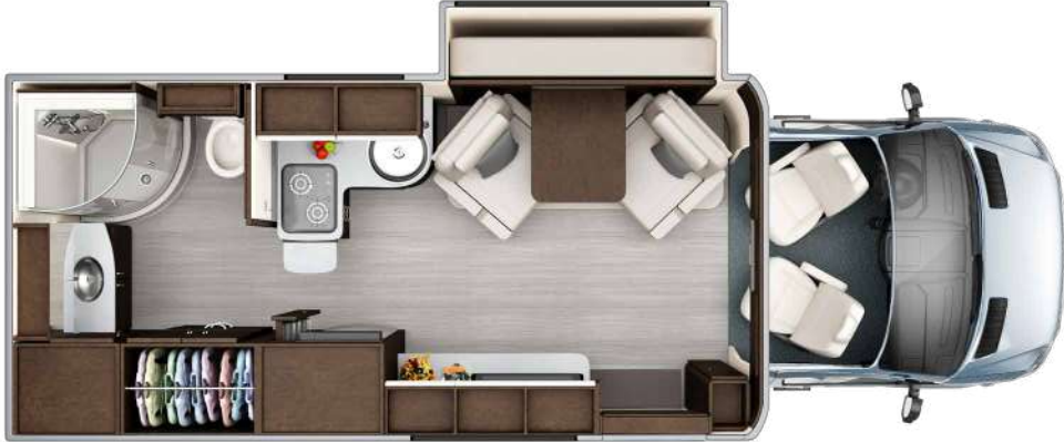
U24MB | Murphy Bed (Shown with optional Leisure Lounge Plus)