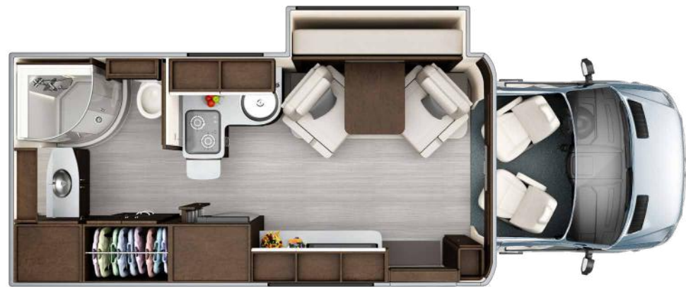
U24MB | Murphy Bed (Shown with optional Leisure Lounge Plus)