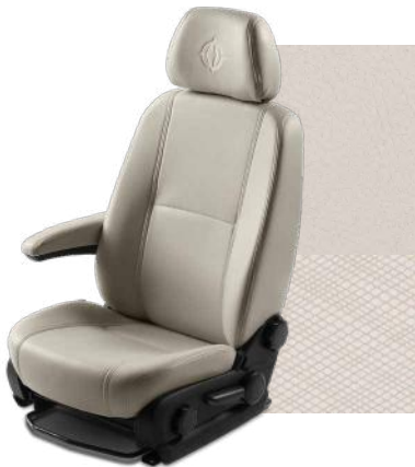
FOG Ultraleather™ with Accent