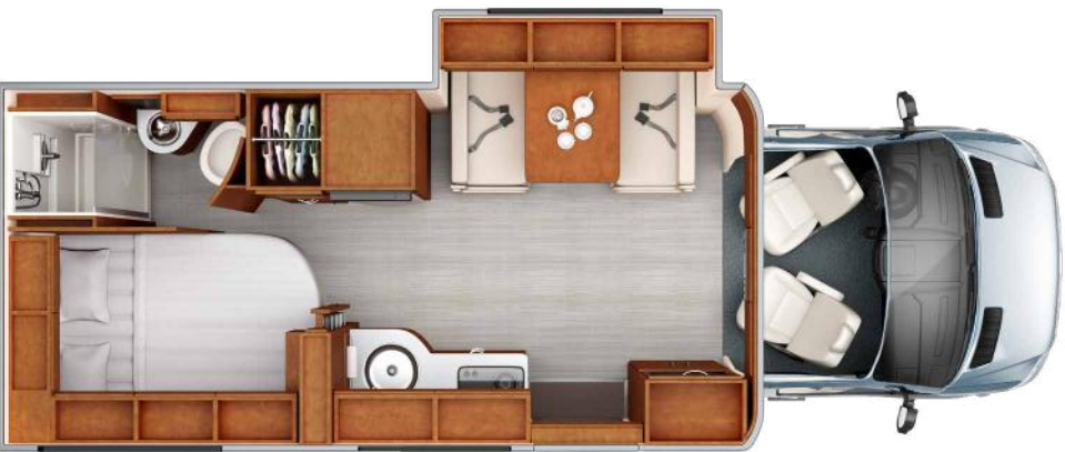
U24CB | Corner Bed (Shown with Standard Dinette)