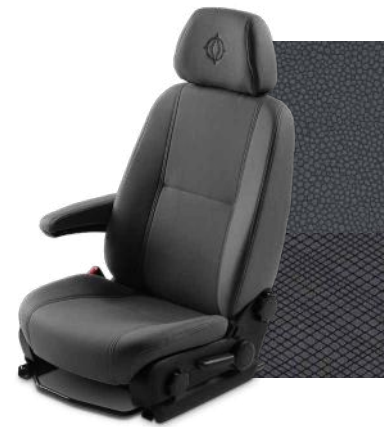
COAL Ultraleather™ with Accent