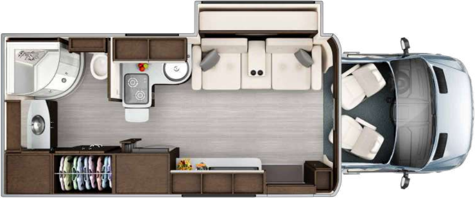
U24MB | Murphy Bed (Shown with standard Leisure Lounge)