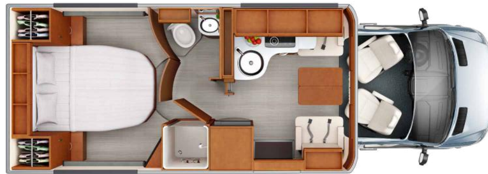
U24IB | Island Bed