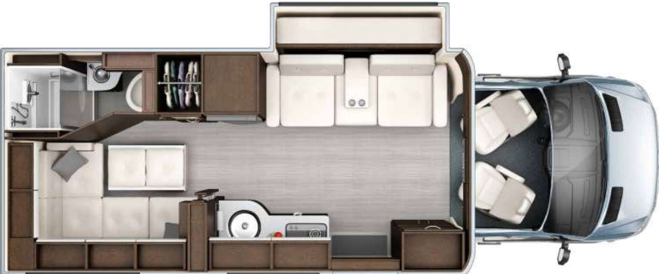
U24FX | Flex