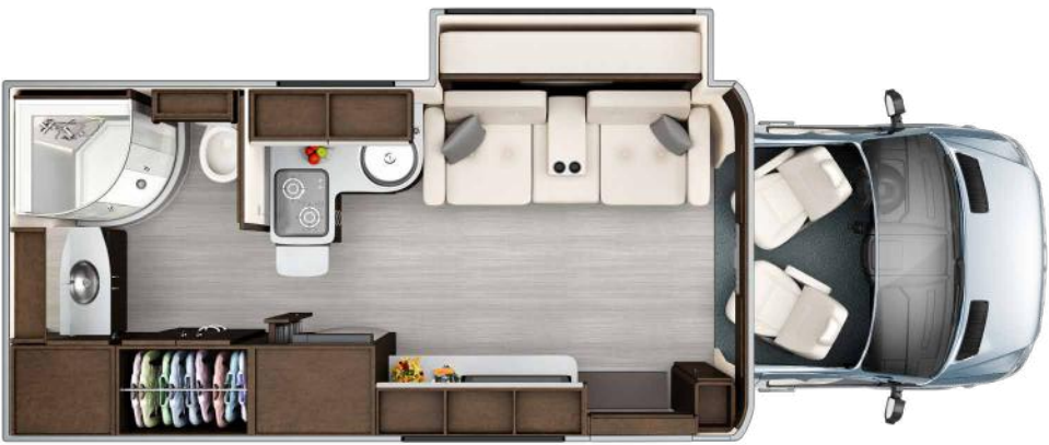
U24MB | Murphy Bed (Shown with standard Leisure Lounge)