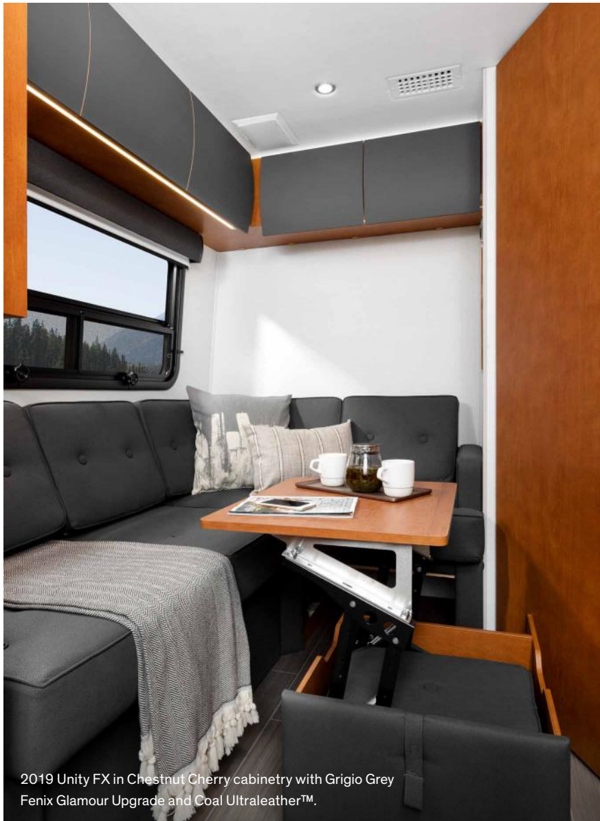
2019 Unity FX in Chestnut Cherry cabinetry with Grigio Grey Fenix Glamour Upgrade and Coal Ultraleather™.