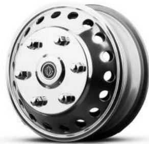
Steel Wheels Standard – With Wheel Simulators