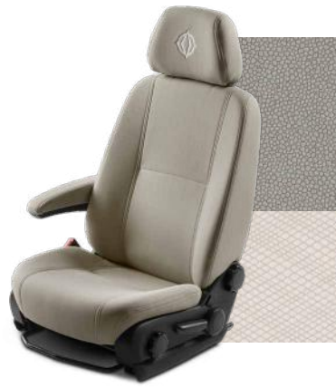
PEBBLE Ultraleather™ with Accent