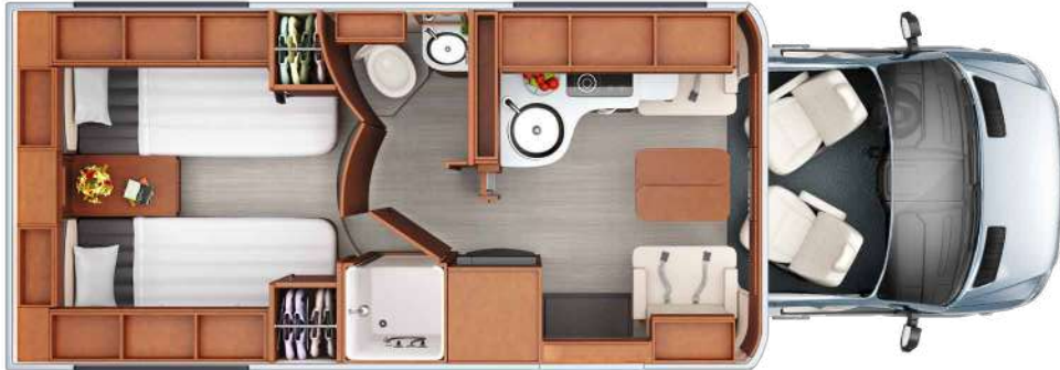
U24TB | Twin Bed