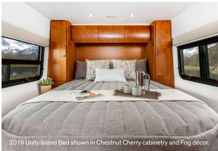
2019 Unity Island Bed shown in Chestnut Cherry cabinetry and Fog décor.