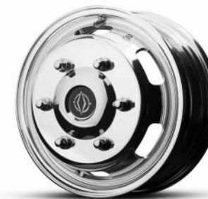
Alcoa Dura-Bright® Aluminum Wheels

Optional – All 6 Aluminum Wheels, 4 Dura-Bright® Wheels