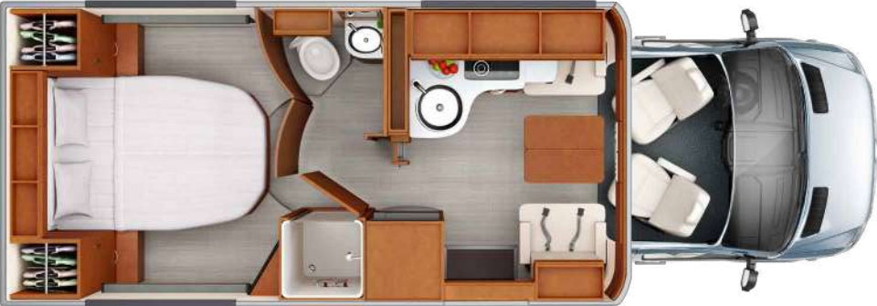
U24IB | Island Bed