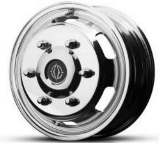
Alcoa Dura-Bright® Aluminum Wheels Optional – All 6 Aluminum Wheels, 4 Dura-Bright® Wheels