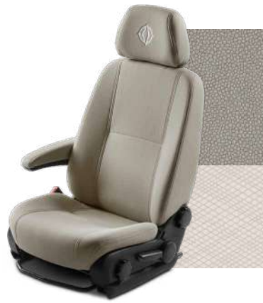
PEBBLE Ultraleather™ with Accent